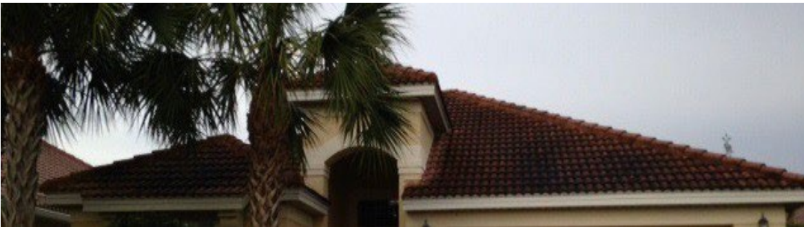
Exhibit “D” Del Webb Oak Creek HOA