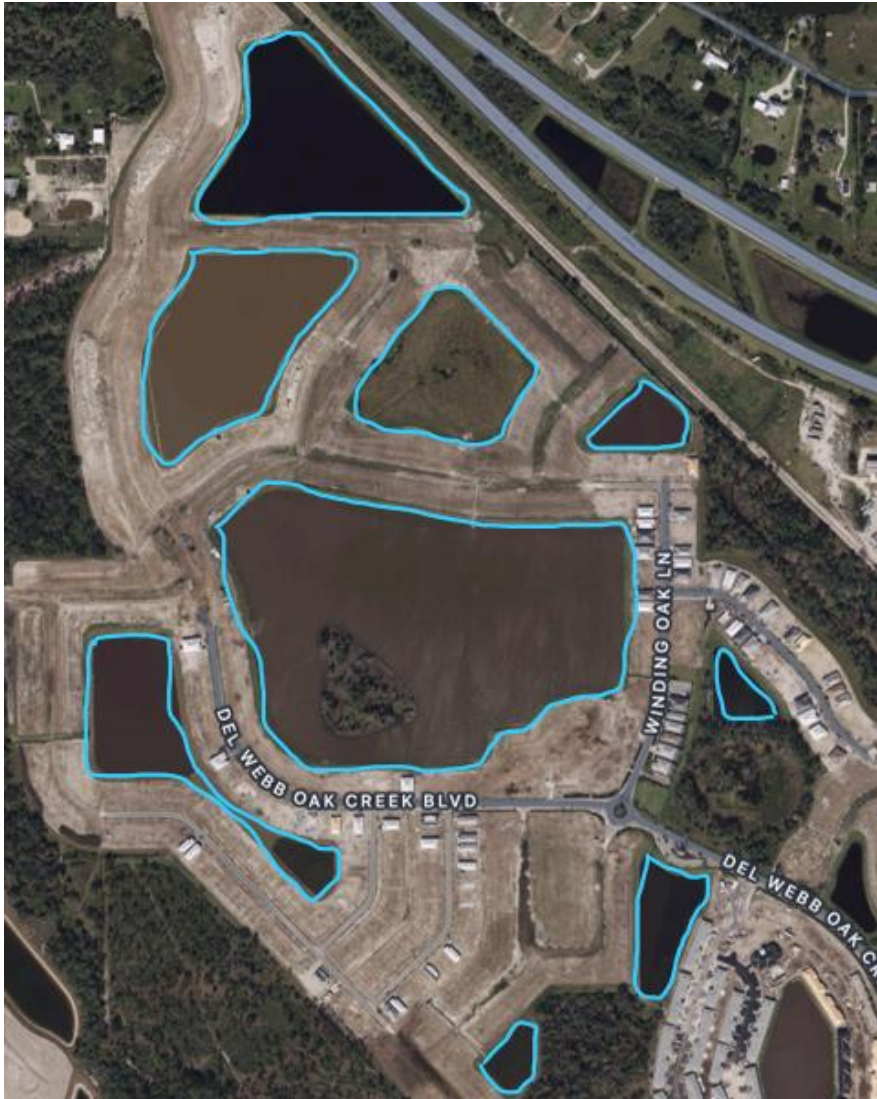
— : Larvicide Areas